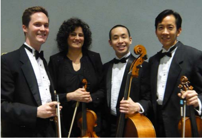
New Jersey Symphony Orchestra Reach Program musicians will perform Broadway Bound in the Main Library Auditorium on Thursday, October 20, at 7 pm.

Elizabeth Public Library, 11 South Broad Street, Elizabeth, NJ www.elizpl.org 908-354-6060